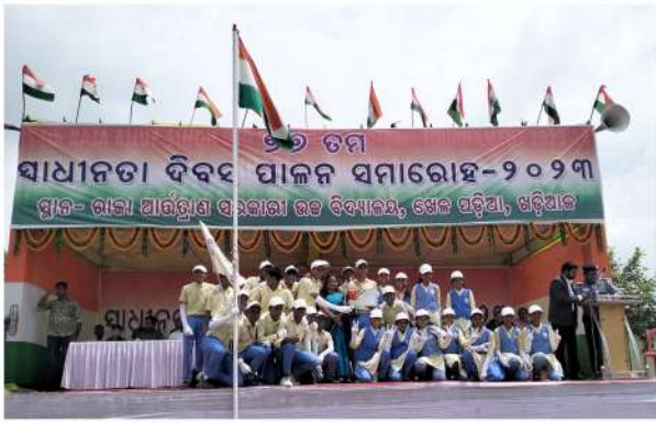
Independence day Celebration at OAV- BADI , KHARIAR, NUAPADA