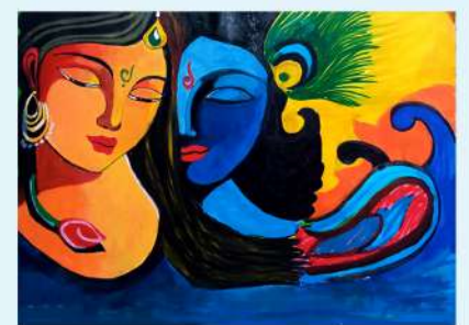
SUSHREE APARUPA BEHERA, CLASS -X OAV- SUANPADA, GHASIPURA