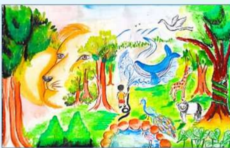
SUMAGNA TRIPATHY, CLASS-IX OAV, SRIRAM, CUTTACK SADAR, CUTTACK