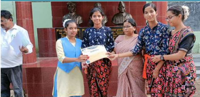
Students of OAV Akhupadar, Odagaon, Nayagarh Secured 1st prize in District Level Folk Dance Competition and got selected to State level.