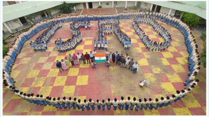
Tribute to ISRO by OAV PIPILIPALI, SONEPUR ,on being the first ever country to achieve soft landing on the south pole of moon