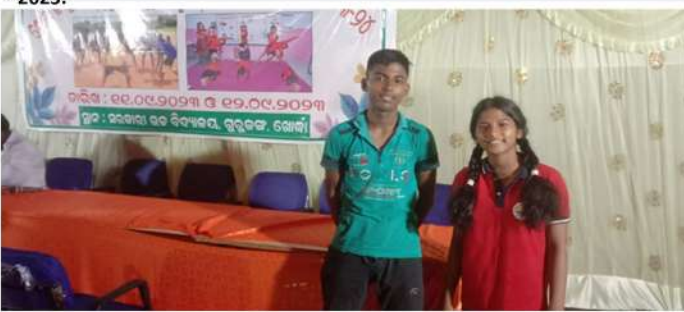
Students of OAV Messingput, Lamtaput got first prize in District Level Science Seminar, Koraput & got selected for State Level Science seminar -2023.