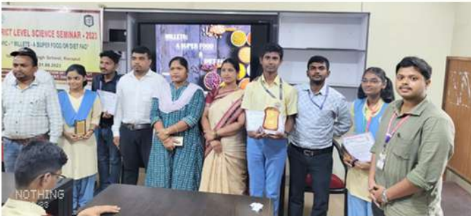
Students of OAV Messingput, Lamtaput got first prize in District Level Science Seminar, Koraput & got selected for State Level Science seminar -2023.