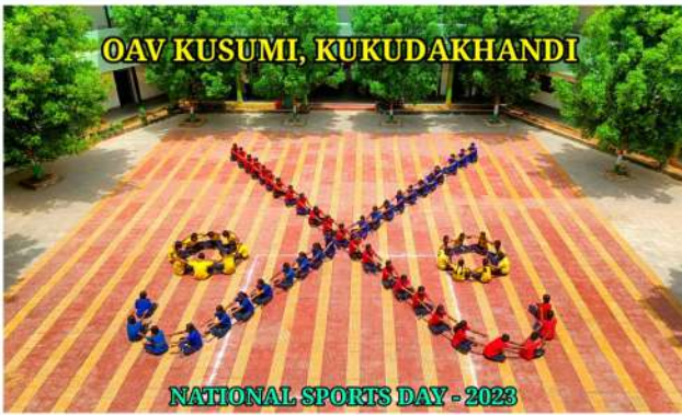
National Sports Day celebration at OAV, Kusumi, Kukudakhandi, Mayurbhanj