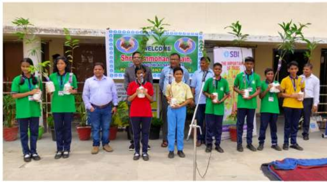
Plantation Program at OAV, Parmanpur, Sambalpur in the association with State Bank of India, Sambalpur