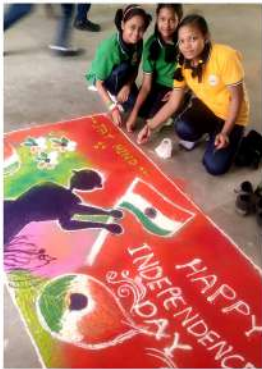
Rangoli making on the occasion of Independence day Celebration at OAV, Sialia, Khordha