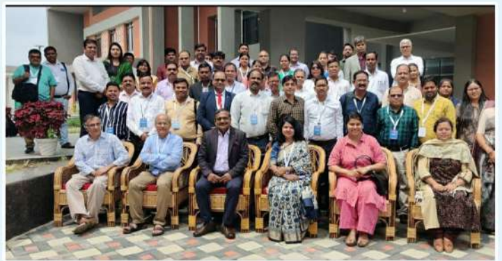
Training of All 30 Nodal Principals of OAVs at IIM, SAMBALPUR from 23/08/2023 to 26/08/2023