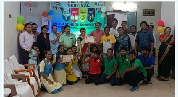
Drama, essay writing and Drawing competitions had been organised by Legal Literacy Club, Berhampur, Ganjam. OAV, kusumi got first prize in Drama, 1st in essay writing and second in Drawing competition